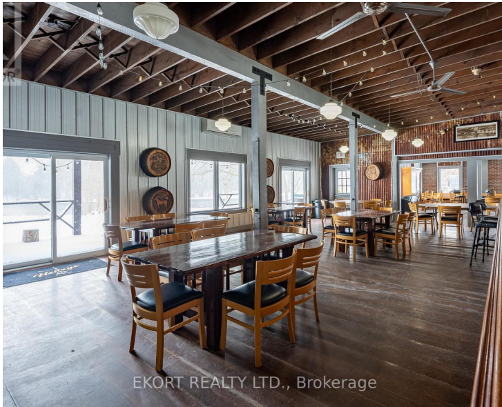
EKORT REALTY LTD., Brokerage