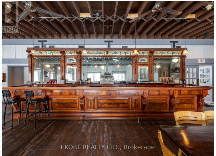
EKORT REALTY LTD., Brokerage