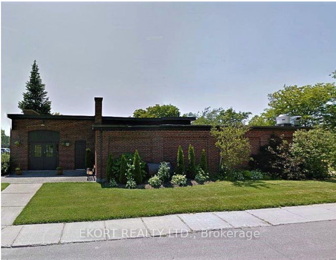
EKORT REALTY LTD., Brokerage